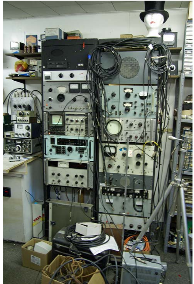
One of David's equipment racks