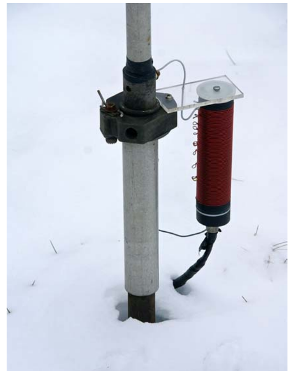
Vertical Antenna Loading Coil